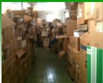
Managing inventory becomes secondary to patient care.

Managing and inventorying the supply shipments arriving daily was difficult. It's not that the volunteers and staff weren't getting supplies; supplies were arriving every day, but there was not enough available staff to sort through it. So boxes of supplies, pharmaceuticals, and equipment, many of which had labels printed in French, were stacked in hall ways and rooms.